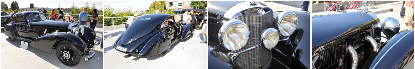
Figure 3: 1938 Mercedes-Benz 540K Autobahn-Kurier.

unnecessarily). Sometimes it can feel like \LaTeX has a mind of its own when it comes to placing the figures, but you can help it along by moving the figure definition up and down in the text until \LaTeX places the figure where you want it. Some trial and error is often needed.