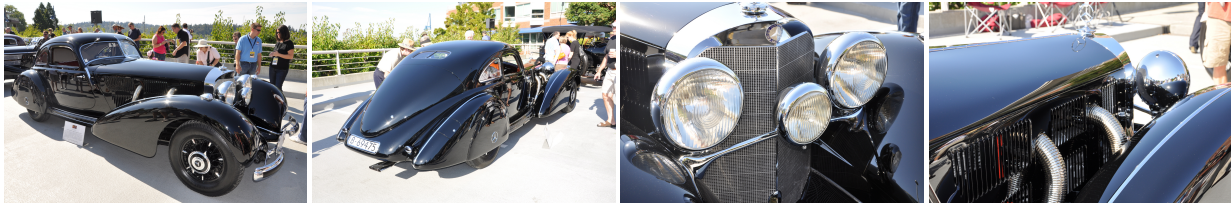
Figure 3: 1938 Mercedes-Benz 540K Autobahn-Kurier.

unnecessarily). Sometimes it can feel like \LaTeX has a mind of its own when it comes to placing the figures, but you can help it along by moving the figure definition up and down in the text until \LaTeX places the figure where you want it. Some trial and error is often needed.